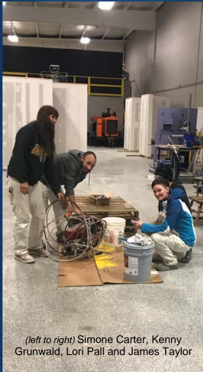
Northern Training Center—Spray Class (Merrillville, IN)